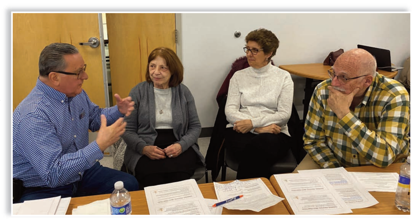
Participants in the listening process.

As I expressed in my previous pastoral letter, it was important to me that our pastoral planning not be a top-down process. If we are truly United in Christ, then we all must have the opportunity to actively participate in shaping the future of our Diocese. While a Core Diocesan Leadership Team was established which provided oversight and coordination, in a spirit of synodality, regional teams were formed in all 7 deaneries throughout the diocese. These "Deanery Leadership Teams" were comprised of parishioners, lay leaders, and clergy who were asked to imagine what increasing vibrancy might look like in their particular region. Each Team was tasked to